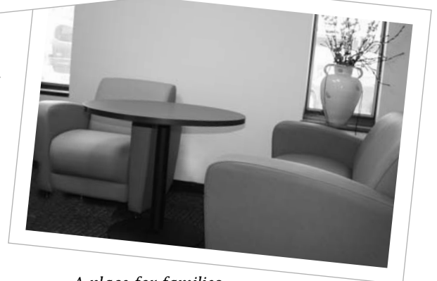
A place for families