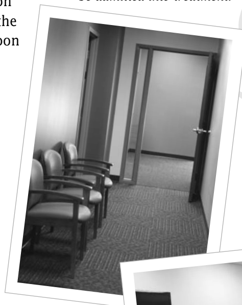
A quiet place for women to be admitted into treatment.

OUR MISSION St. Monica's is committed to the sobriety of women of all ages through empowerment, stability and self-fulfillment.