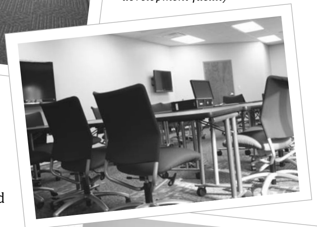
Our new training and development facility