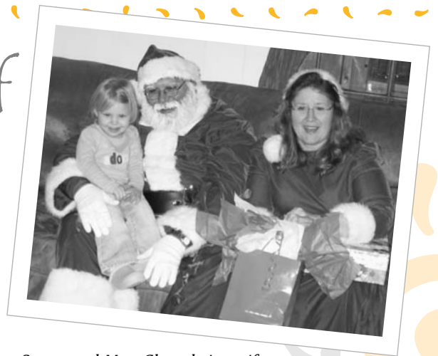
Santa and Mrs. Claus bring gifts and cheer to Project Strong Families